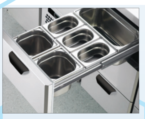
GN dividing frame (GN-containers not included)